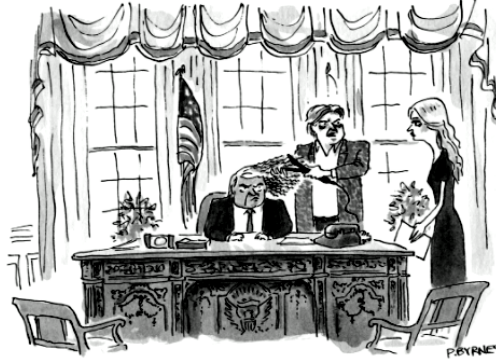
"We're running out of diversions. We have no choice but to crimp his hair."